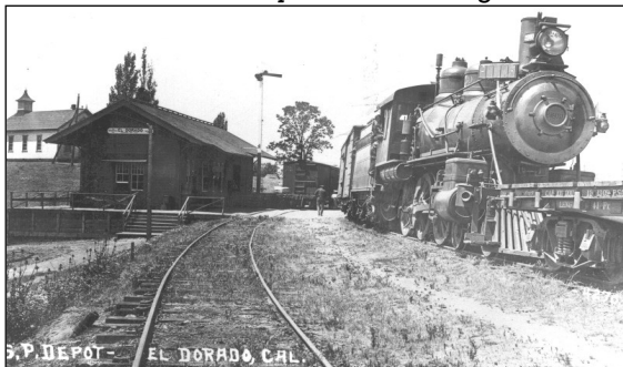
This 1912 photo shows the El Dorado Depot, built in 1888. It served both passengers and freight on the Placerville Branch of the Southern Pacific Railroad. The El Dorado School, a one room schoolhouse and now the El Dorado Community Hall, is seen at the left edge of the photo.

The historic Shingle Springs Turntable and a railroad maintenance yard near the historic Diamond Springs Station are currently in the planning stages.